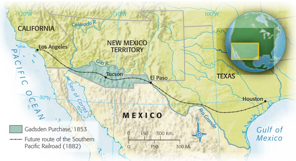
MAP 18.6 The Gadsden Purchase, 1853

Coast. But the estimated cost in all cases was so great that for many years there could obviously be only one line. Should its terminus be in the North or in the South? The favored section would reap rich rewards in wealth, population, and influence. The South, losing the economic race with the North, was eager to extend a railroad through adjacent southwestern territory all the way to California.