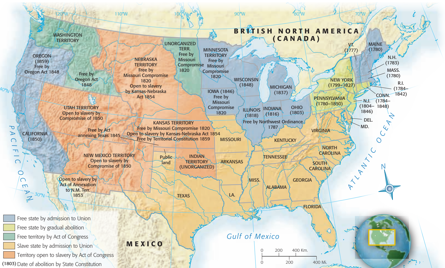
MAP 18.4 The Legal Status of Slavery, from the Revolution to the Civil War © Cengage Learning

The intoxicating victory in the Mexican War, coupled with the discovery of gold in California just nine days before the war’s end, reinvigorated the spirit of Manifest Destiny. The rush to the Sierra Nevada goldfields