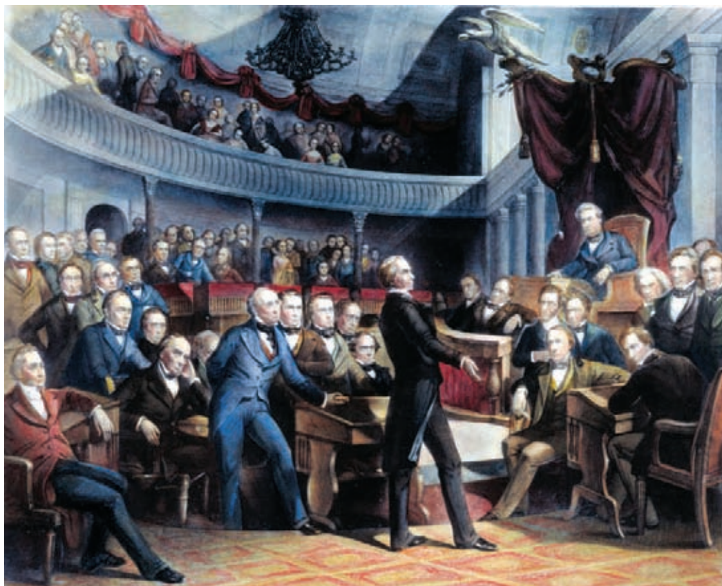
Henry Clay Proposing the Compromise of 1850 This engraving captures one of the most dramatic moments in the history of the United States Senate. Vice President Millard Fillmore presides, while on the floor sit several of the “Senatorial Giants” of the era, including Daniel Webster, Stephen A. Douglas, and John C. Calhoun.

Most alarming of all, the drastic new Fugitive Slave Law of 1850—“the Bloodhound Bill”—stirred