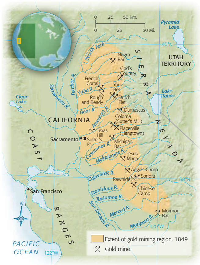
MAP 18.1 California Gold Rush Country Miners from all over the world swarmed over the rivers that drained the western slope of California's Sierra Nevada. Their nationalities and religions, their languages and their ways of life, are recorded in the colorful place names they left behind.