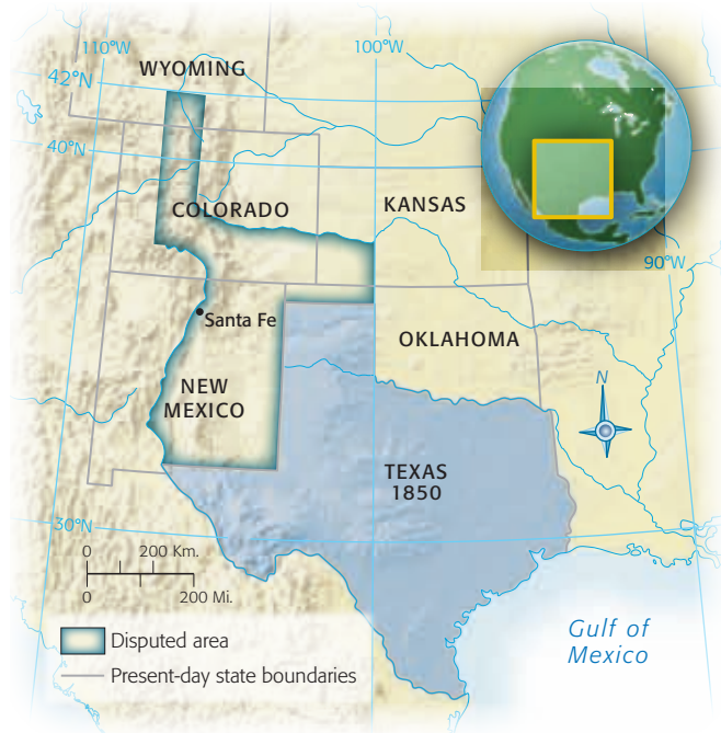
MAP 18.2 Texas and the Disputed Area Before the Compromise of 1850 © Cengage Learning

By 1850 southerners were demanding a new and more stringent fugitive-slave law. The old one, passed by Congress in 1793, had proved inadequate to cope with runaways, especially since unfriendly state authorities failed to provide needed cooperation. Unlike cattle thieves, the abolitionists who ran the Underground