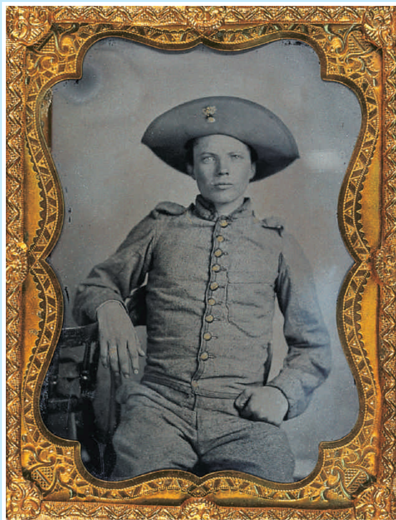
A Confederate Soldier

Shell-shocked and weary, most soldiers returned home from the war utterly transformed. For nearly a decade and a half, silence reigned, as veterans and civilians entered into a tacit agreement to put the ordeal