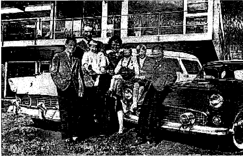
The new problem is getting the picture and getting the new Ford to drive with.

what consumers needed was another. This advertisement suggests that the up-to-date family, living in its modern-style suburban home, had no choice but to own two cars, one for the male breadwinner's business, the other for the wife's "ferrying the family." What kinds of gender role prescriptions are reinforced in this advertisement? What assumptions has Ford made about prospective buyers of its cars? How much can mass advertising tell us about the actual values of Americans living at a particular time?